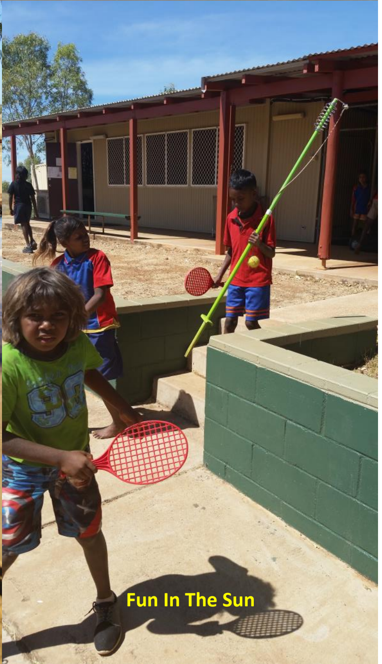
Fun In The Sun