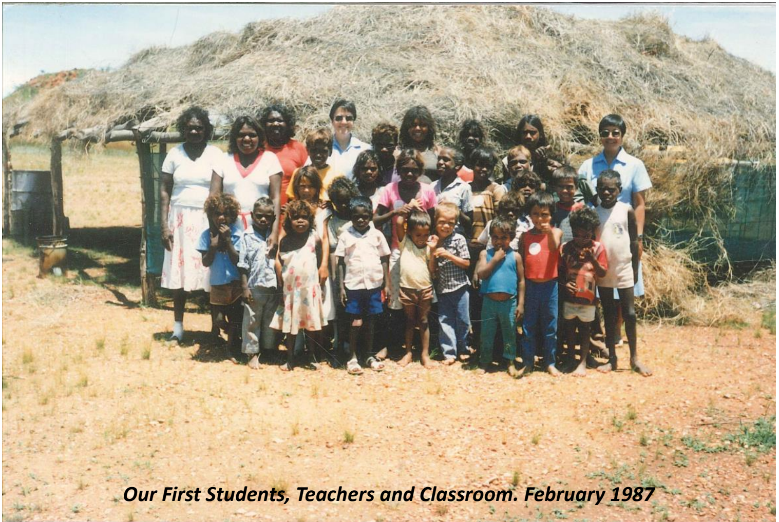
Our First Students, Teachers and Classroom. February 1987