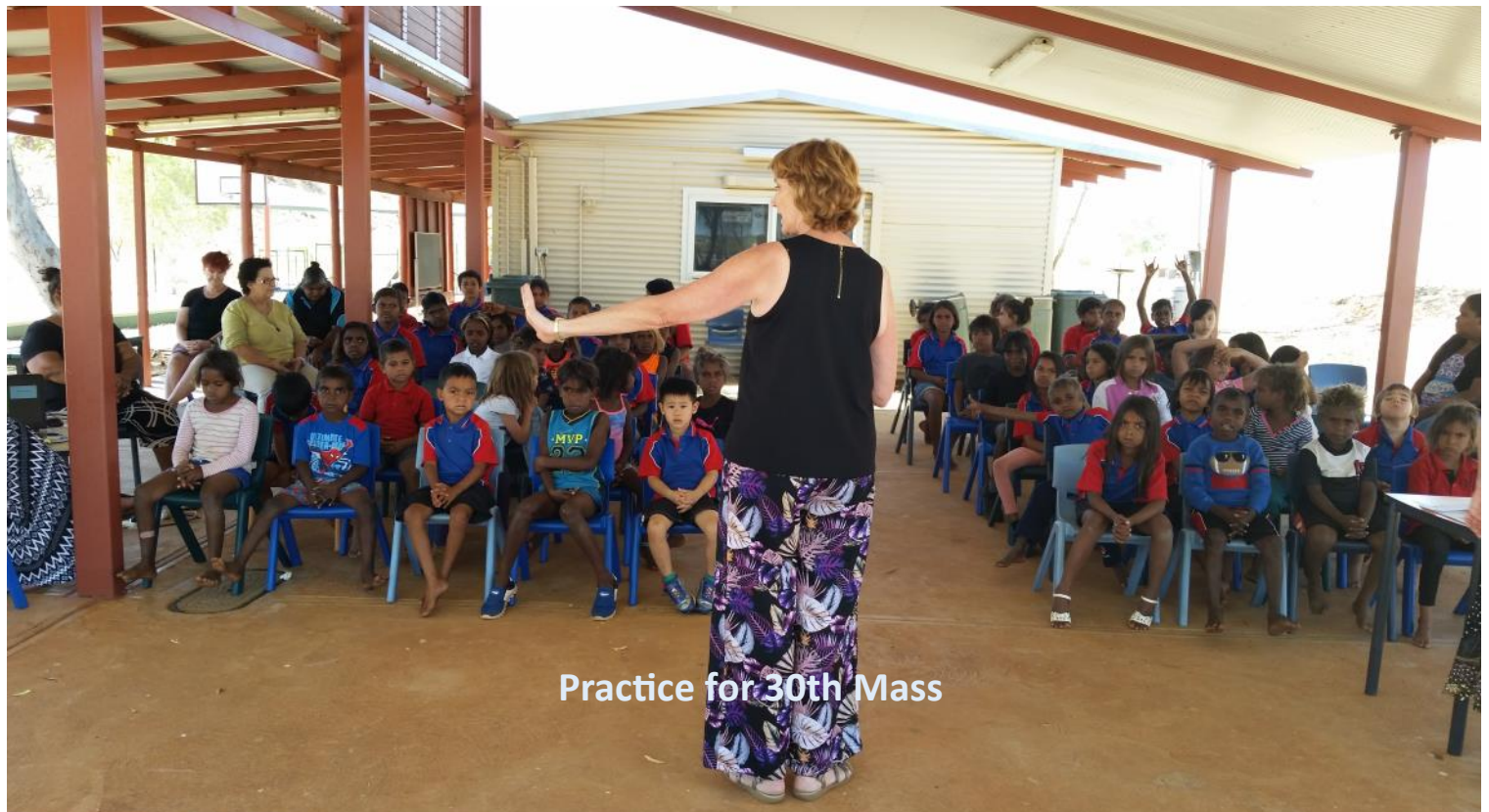
Practice for 30th Mass