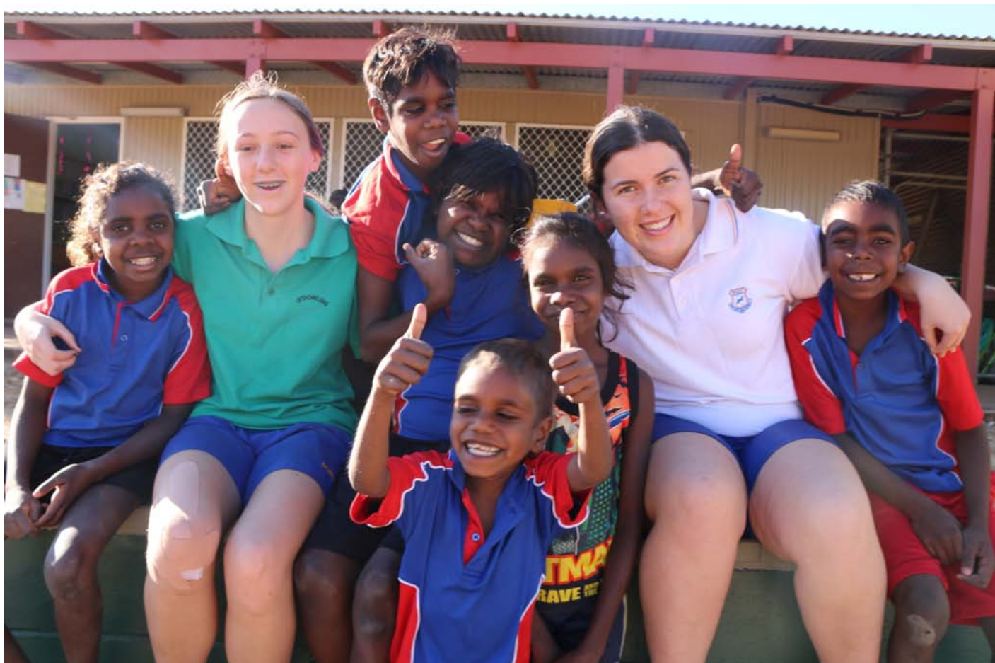
Iona Presentation College visit this week