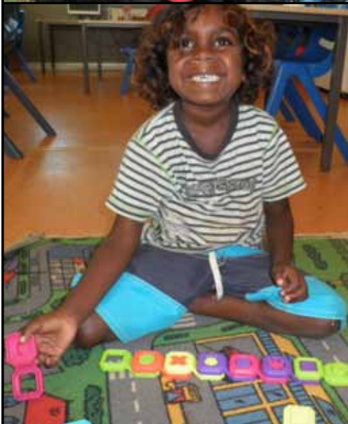
Kids at Red Hill School where we work, play, learn and grow together.