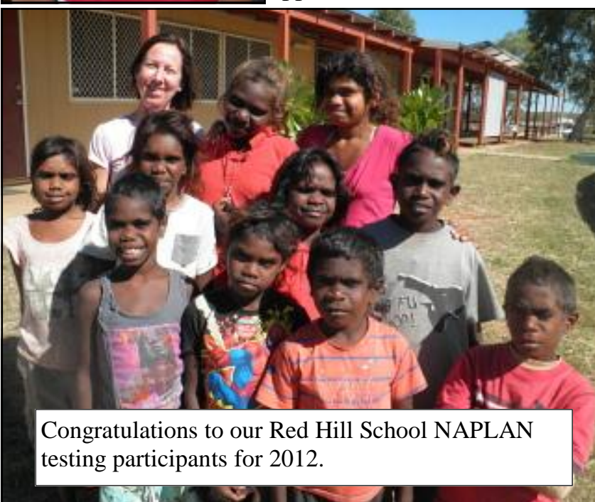
Congratulations to our Red Hill School NAPLAN testing participants for 2012.

A PATHS "Fish of the Day" is chosen each day at Warlawurru School. Please ask your child if they were chosen today.